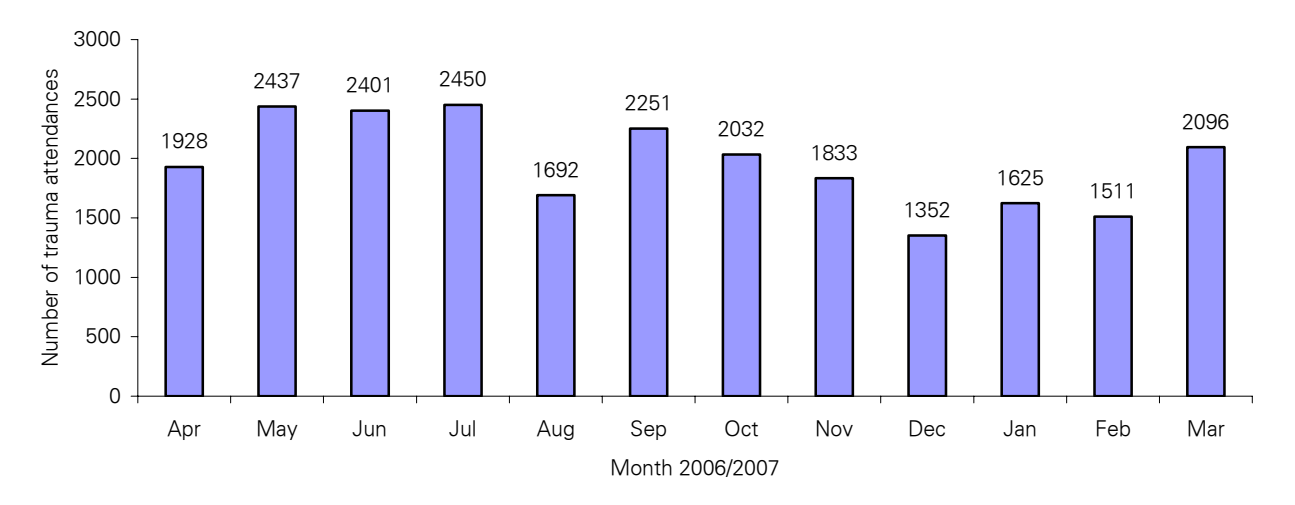
Figure 1: Total number of trauma attendances by month, April 2006 to March 2007

Figure 2 gives a breakdown of trauma attendances by gender. For each month there were more male trauma attendances than female presenting at Alder Hey A&E department.